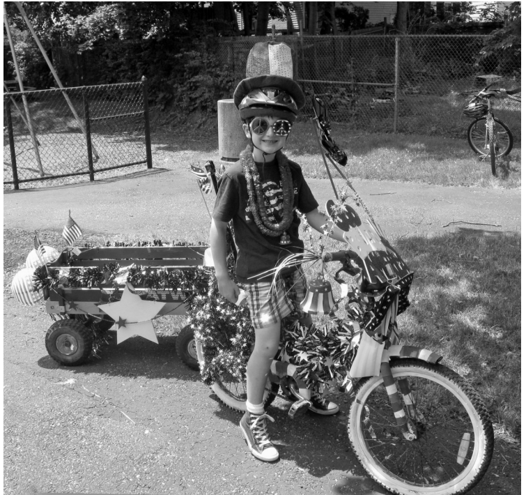
A reminder of summer: The July 4th Parade had outstanding participation this year. The children were extra creative in their bike and float decorating.

know. We would also like to know of any new neighbors that have moved into the neighborhood this year so we can welcome them.